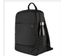
Side pockets for an umbrella or a water bottle

A lightweight backpack crafted from eco-friendly fabric made from recycled plastic, designed with a sleek and modern aesthetic. This compact backpack is ideal for carrying MacBooks and Laptops up to 15.6 inches. This backpack offers both style and functionality. The adjustable, padded shoulder straps and ergonomic back panel ensure maximum comfort during daily commutes or extended wear. An organizer zipper pocket on the front provides easy access to essentials & accessories making this backpack a practical choice for both work and leisure.