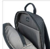
Padded Inner Compartment