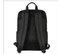
Adjustable, Padded Shoulder Straps