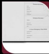
180° Lay Flat Design