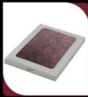
Individual Packaging With Transparent Top Cover For Logo & Name Visibility