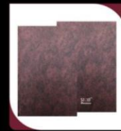
Front & Back